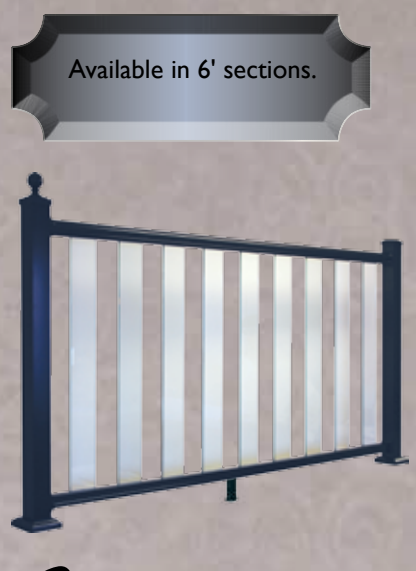
Includes railing section support for each section.